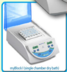
myBlock I (single chamber dry bath)