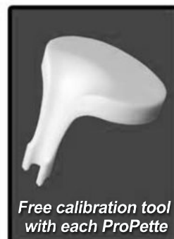
Free calibration tool with each ProPette